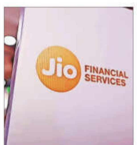
The joint venture was incorporated on Sept 6 to carry on the primary business of investment advisory services, the company said in a filing

JIO FINANCIAL SERVICES on Sunday said it has formed a joint venture with BlackRock Advisors Singapore to undertake investment advisory business.